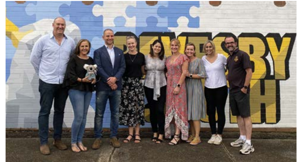
Revesby South Public School