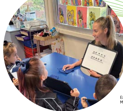
Explicit and Systematic Teaching (EAST) Mathematics Project

The Empower Me! framework and program is a proactive wellbeing initiative designed for mainstream and specialist schools, focusing on the explicit instruction of positive behavioural choices. This program addresses issues such as non-compliance, anger management and emotional self-regulation, serving as essential teaching and learning materials for preventative mental health. By emphasising the significance of student wellbeing and voice, Empower Me! aims to enhance student engagement and empower learners to make informed, positive choices. This resource reflects a commitment to fostering a supportive educational environment that prioritises student wellbeing, mental health and the development of essential life skills.