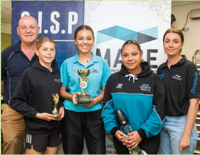
Murrumbidgee Regional High School