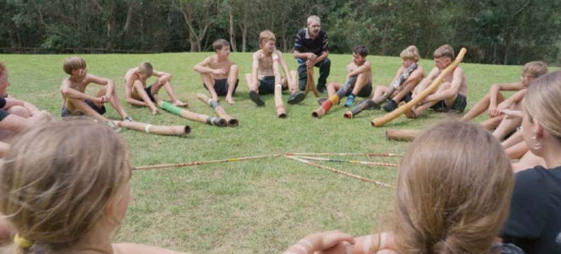
Whitebridge High School

WATERFALL PUBLIC SCHOOL BANGOR PUBLIC SCHOOL ENGADINE HIGH SCHOOL ENGADINE PUBLIC SCHOOL ENGADINE WEST PUBLIC SCHOOL HEATHCOTE EAST PUBLIC SCHOOL HEATHCOTE HIGH SCHOOL HEATHCOTE PUBLIC SCHOOL LOFTUS PUBLIC SCHOOL MARTON PUBLIC SCHOOL MENAI HIGH SCHOOL MINERVA SCHOOL THARAWAL PUBLIC SCHOOL WORONORA RIVER PUBLIC SCHOOL YARRAWARRAH PUBLIC SCHOOL