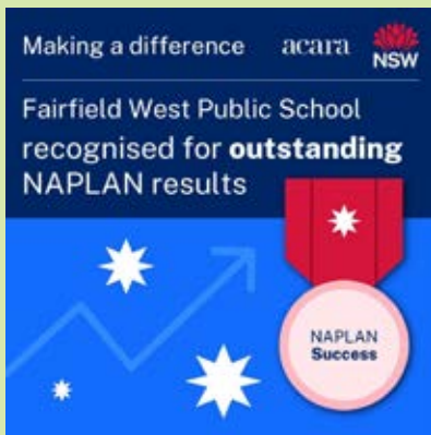
Fairfield West Public School