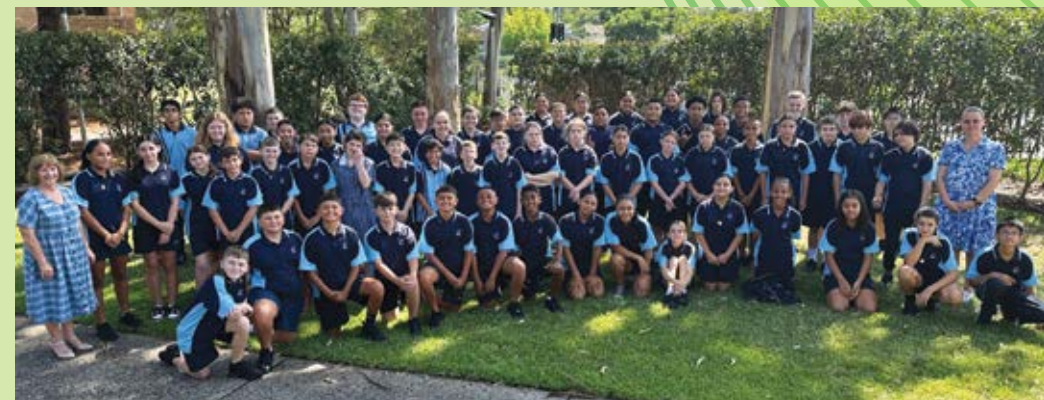
James Meehan High School