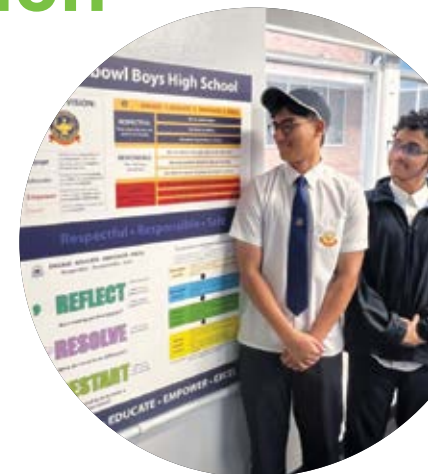
Punchbowl Boys' High School