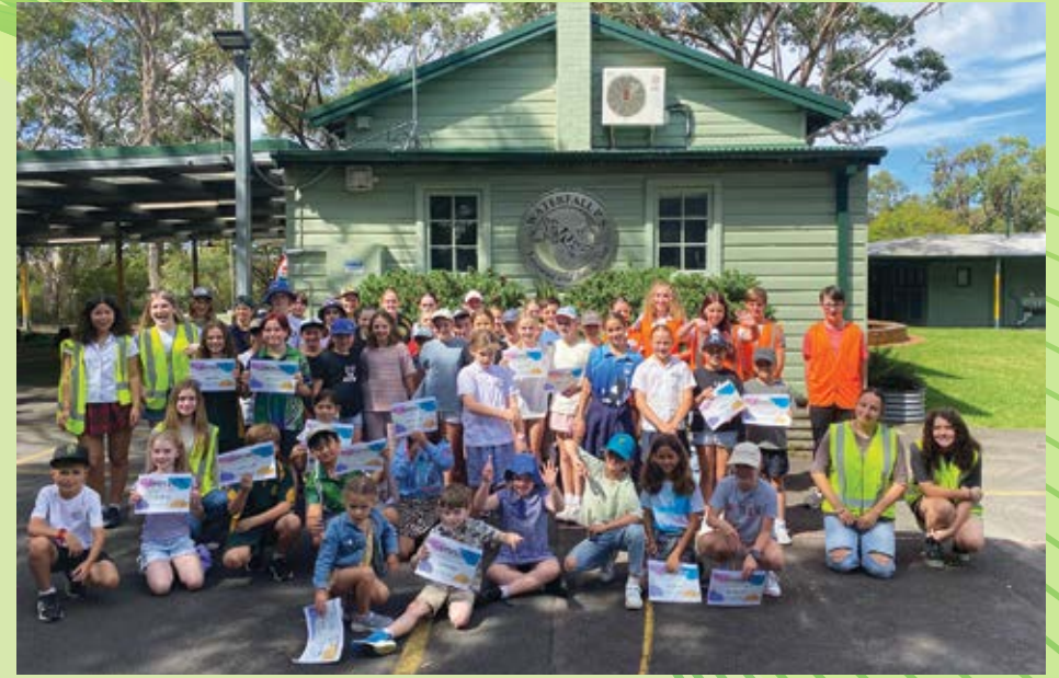
Waterfall Public School Group