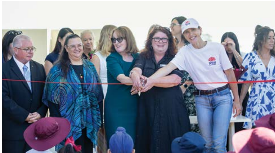
Box Hill Temporary Primary School opening