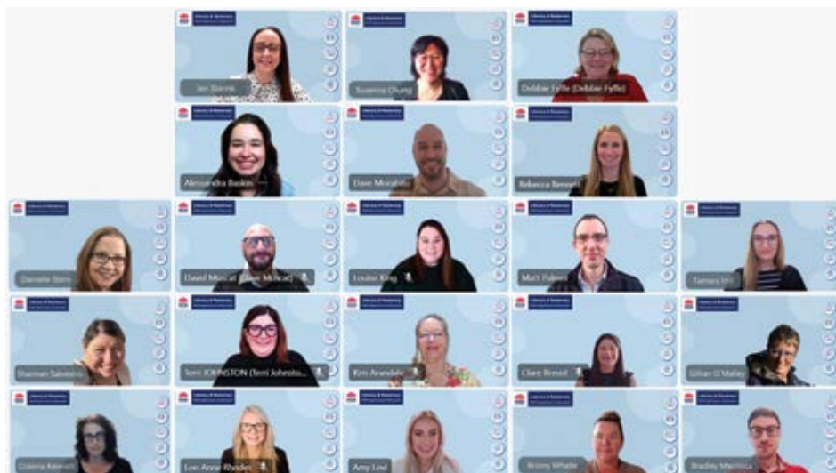
Literacy and Numeracy Practice Guide Project Team