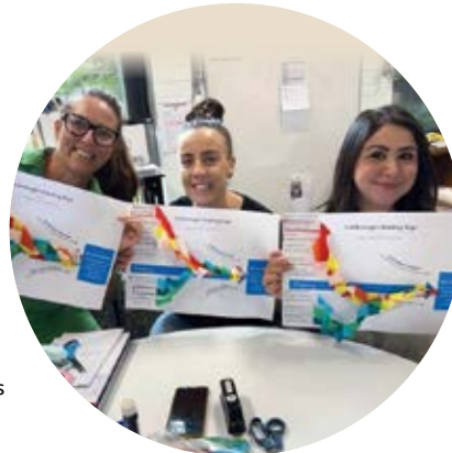
Auburn North Public School