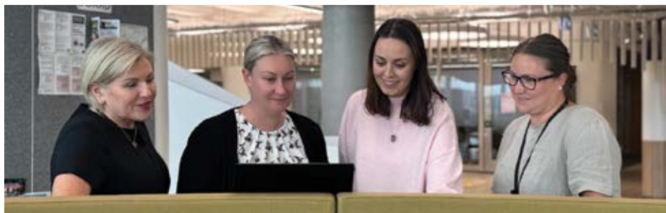
School Experience Program Team

The Early Learning team in Early Childhood Education and Care manage the responsibility of the department as Approved Provider of NSW public preschools. The preschool team within Early Learning are qualified early childhood teachers who draw on their expert knowledge of the National Quality Framework and their experience as preschool teachers or school leaders to support schools with public preschools to engage in ongoing continuous improvement practices ensuring all public preschools meet the requirements of the National Quality Framework, are compliant with the National Law and Regulations, and meet or exceed the National Quality Standards.