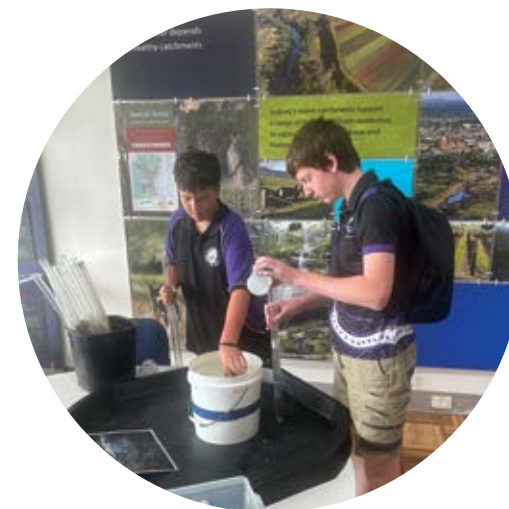
Ajuga School and Georges River Environmental Education Centre

GREEC was proud to partner with Ajuga School, fostering a collaborative environment that values both students and staff. Throughout this project, students have shown remarkable dedication and curiosity, engaging deeply with each initiative and understanding the significance of their contributions. This commitment has enriched their learning experience and promoted a culture of knowledge sharing within the community. Ajuga School exemplifies respect and personal growth, as seen in the students' dedication to the project. This partnership highlights the positive impact of collaborative educational initiatives, and we look forward to further opportunities for growth together.