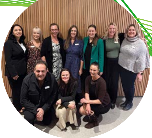
Preschool Team in Early Learning