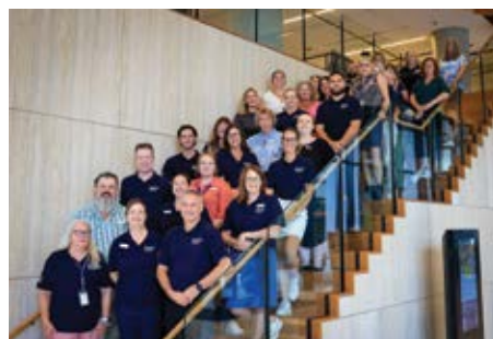
School-Based Apprenticeships and Traineeships (SBAT) Engagement Team

supporting students to engage in meaningful pathways through the implementation of quality SBAT programs. In 2025, there are 31 SBAT Engagement Officers who focus on increasing stakeholder engagement and provide localised support across a group of schools. The team has significantly impacted growth in SBAT participation, driving a 19% increase in SBAT participation from 2022 to 2024. The team demonstrates Excellence every day through their dedication, adaptability, and collaboration that drive their incredible results.