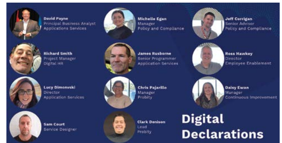
Digital Declarations Team

In Term 4 2024, Digital Declarations was launched which streamlines the screening of non-employees such as volunteers, contractors, parents and carers. Digital Declarations removed the need for paper forms and duplicate screening across schools through digital submission (via a phone) as well as central storage of declarations. Digital Declarations allows instant verification of WWCC, simplified screening outcomes, audit log, and the ability to upload supporting documents. This means faster, clearer, and more compliant screening while reducing administrative burden on schools. Digital Declarations was trialled by 300 schools in T3 2024 and is now being used by over 1600 schools with over 45,000 Digital Declarations submitted.