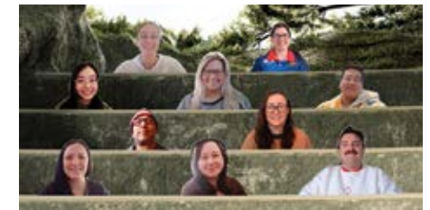
Community and Mobile Preschool Funding Team

in learning. As an engine behind Start Strong, they expertly balance sector need with government priorities - supporting services with clarity, empathy, and technical precision. Their leadership in refining processes like fee relief provision ensures policy is shaped by current practice and data. Trusted across the department and the sector, they consistently deliver high-impact work that sustains service delivery while drawing upon practical insights to lay groundwork for all NSW children, now and future, to participate in early childhood education.