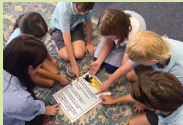
Faulconbridge Public School