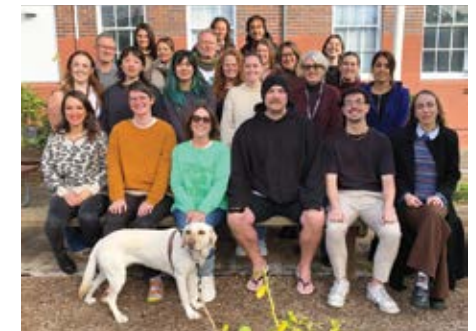
Centennial Park School