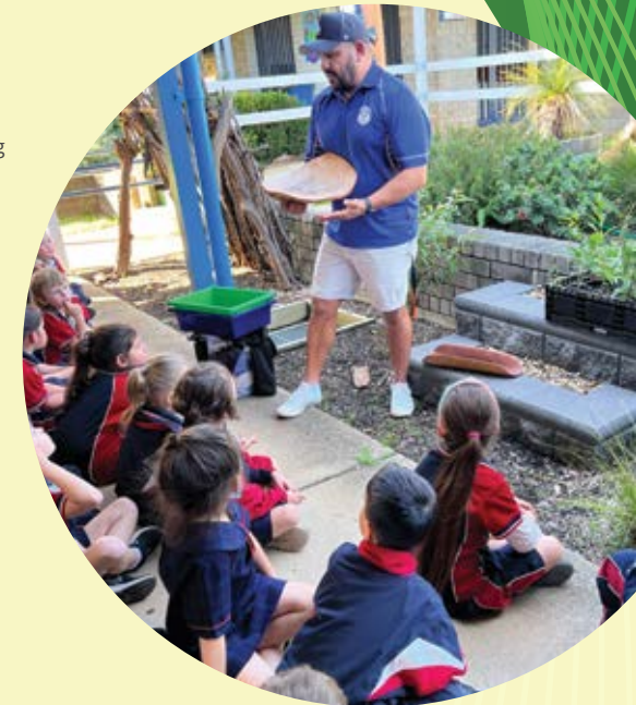
Briar Road Public School