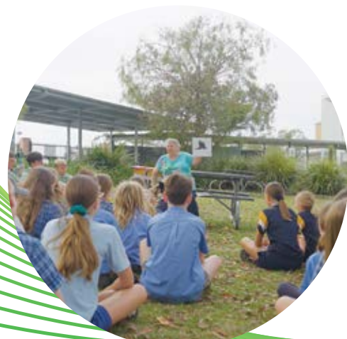
Whitebridge High School

Murrumbidgee Regional High School has built an amazing STEM program that has had a significant and positive impact on rural students, and in particular, Indigenous students. The program has experienced rapid growth across the State allowing students to immerse themselves in high impact STEM programs and competitions. This has resulted in the Deadly STEMers working to a high level and winning the Secondary division of the Aeronautical Velocity Challenge in 2024. This program has allowed students to use real hands-on experiences to develop skills and attempt to solve real world complex problems.