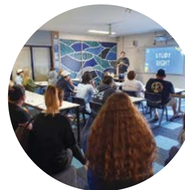
Warilla High School

Revesby South Public School has experienced the transformative effect of our innovative wellbeing approach. By integrating a holistic wellbeing system that focuses on both promoting wellbeing and preventing illbeing, we have developed an environment in which students and staff feel valued, nurtured and empowered to flourish. The SEARCH framework has enhanced individual and collective resilience, encouraged healthier working relationships between students and colleagues, and provided an inclusive school environment. This has led to measurable gains in student engagement and performance. Placing this approach at the heart of everything we do will see educational excellence and long-term success continue at the school.